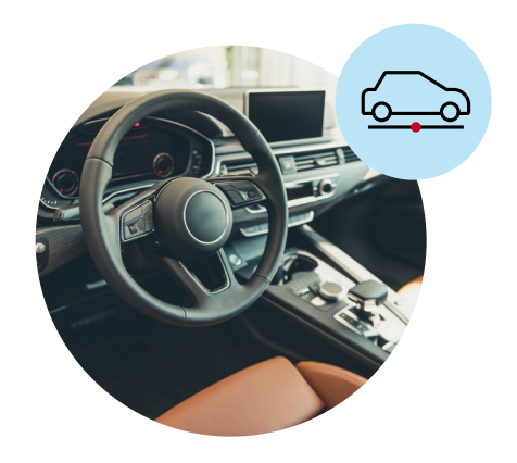
Automotive and Mobility

UL Solutions works with companies in sectors where regulatory change, technological advancement and global expansion converge: