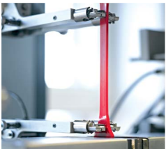
ISO tensile strength