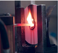
IEC glow-wire flammability/ IEC glow-wire ignition

ISO/IEC/ASTM gives users a basic understanding of the fundamental principles for additive manufacturing, with clear definitions of relevant terms. Standardizing the terminology for AM makes it easier for people involved in this field to communicate across the world.