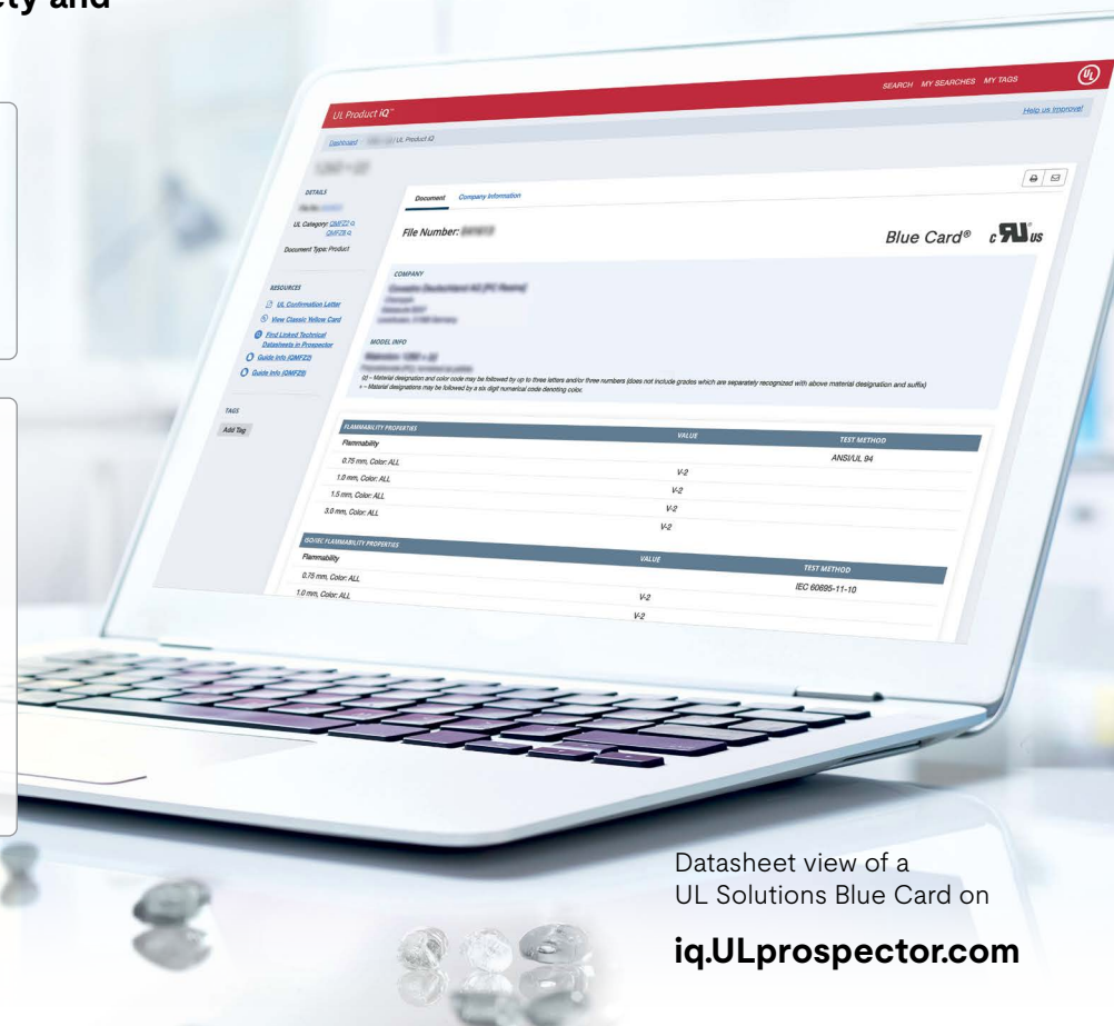
Datasheet view of a UL Solutions Blue Card on

The Blue Card provides confidence that a material will continue to meet requirements for specific applications. Using UL Solutions-tested and certified components – identifiable through the UL Recognized Component Mark on the Blue Card – can also help you save time and money. By eliminating the need for further material testing, it can help shorten the path to certain certifications.